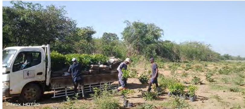
300 Coffee trees from the nursery being unloaded